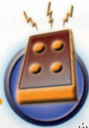
The Interactive Experience

In total darkness, with the surround sound system, we witness a reckless street race in the middle of the night. While our sense of sight is inactive, our brain is sharpened receiving every piece of information and intricate details transmitted through the audio system.