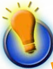
The Inspiration Experience

A professional test driver is taking us on a journey full of extreme driving situations. We will get useful tips from that driver on how to eliminate uncontrolled situations.