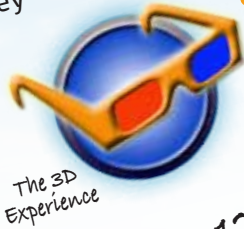
The 3D Experience

The 3D Experience The story of 3 students, celebrating at a New Year party, taking shots of alcohol. Through a 3D journey into the human brain, we learn the processes of the brain, the distortions in data receptivity and interpretation of the reality affected by drinking alcohol.